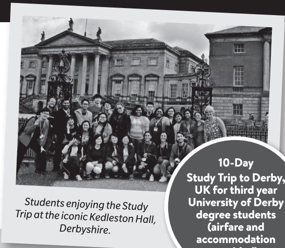
Students enjoying the Study Trip at the iconic Kedleston Hall, Derbyshire.

10-Day Study Trip to Derby, UK for third year University of Derby degree students (airfare and accommodation provided).